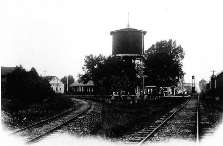
Water Tank at the crossing of D&U and Big Four railroads