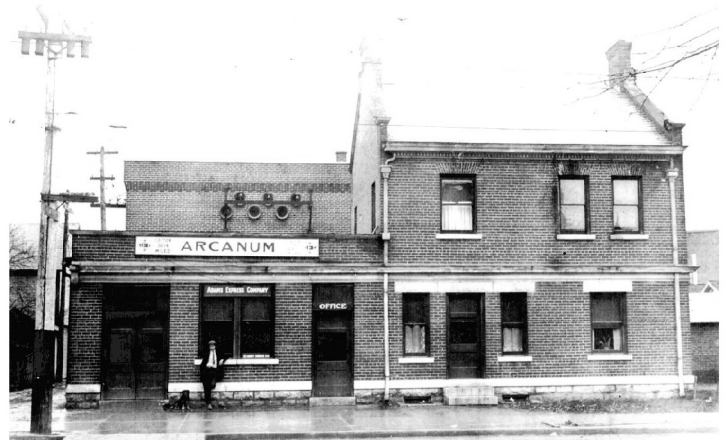
Electric Railway Sub-Station 6 N. Main Street