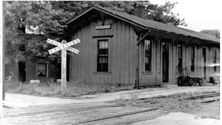
Big Four Depot 213 S. Main St.