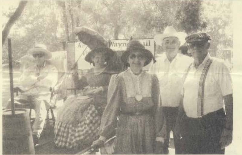
From Annie Oakley parade.