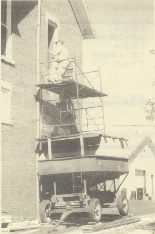
Dick Troutwine replacing a window. What a perch! Wagon brought in by Gene Rench.