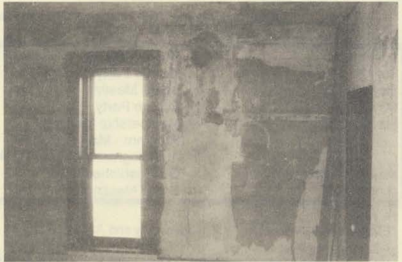
Northwest room before renovation. New window is installed (wall still needs work!)